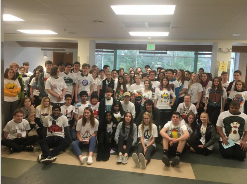
First period Eastlake World Language Students