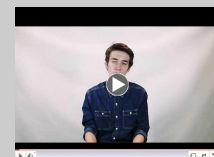
Veterans Day 2017 - Eastlake High School

On Thursday our school watched this Veteran's Day video. We invite you to watch too by clicking the link on the right. Our school-wide activity required the participation of many students and staff who demonstrated thoughtfulness and respect towards our country's veterans.