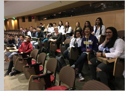
Science Olympiad Members