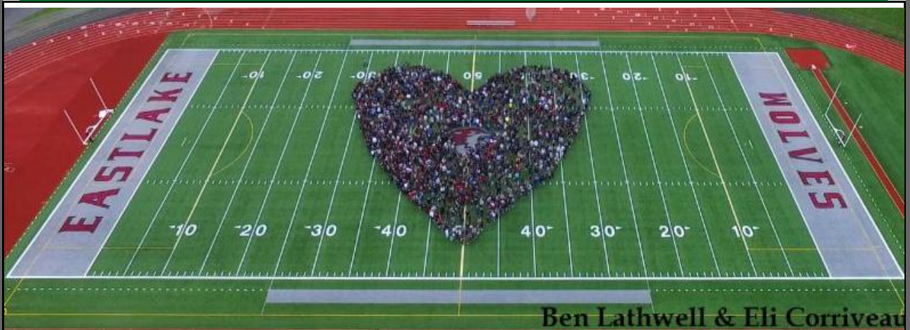
Eastlake staff and students depicting the Eastlake Student Creed

400 228th Ave. N.E., Sammamish, WA 98074 | 425 936-1500