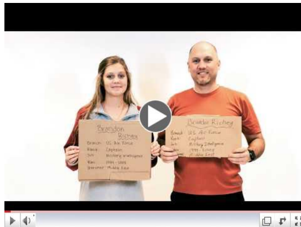
Eastlake Veterans Day Video - Honoring our Veterans

Click here for information on how to sign up.