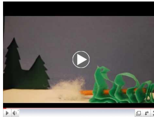
Let It Snow by Eastlake's Imagine Club

There is still time to sign up for the Webbski bus. Click here for details.